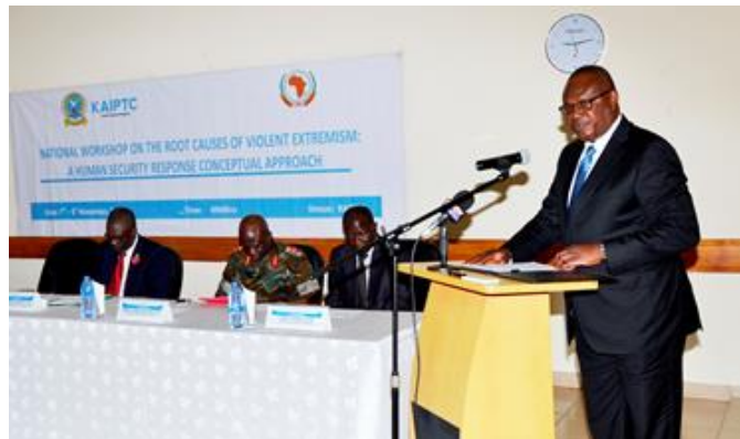
Picture 4: Hon. Prosper Bani (Minister for Interior) delivering the Keynote Address at the Workshop.

Delivering the keynote address, the Minister for Interior, Hon Prosper Bani , reiterated the concern expressed by the Commandant on the growing threat of VE to Africa. He recalled the terrorist incidents in Mali, Burkina Faso and Côte d’Ivoire, and the extent to which those incidents created fear and uncertainty in Ghana. Given that VE is a West Africa-wide challenge with likely consequences on